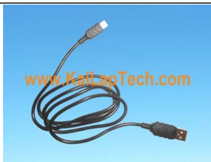
Соединительный USB-кабель Деталь No. KLT-USB6A-Cable

Удлинитель кабеля USB. Продано отдельно.